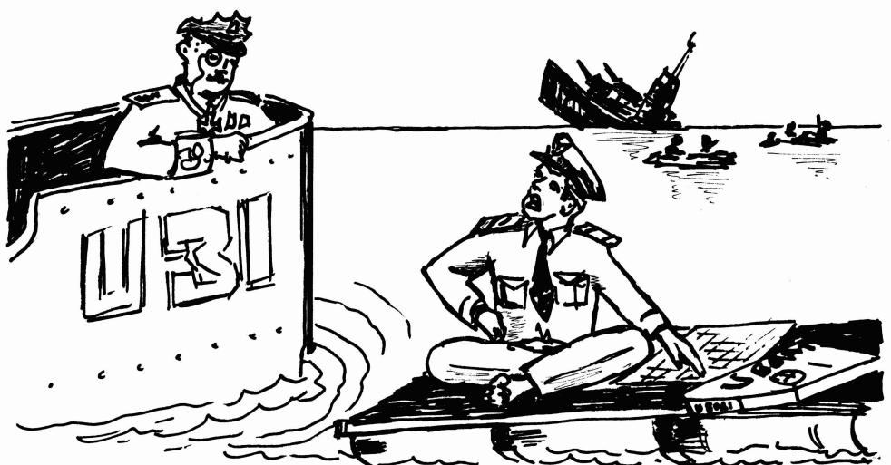
"Now I know where we went wrong"

A. Yes, but it must stop on the first non-road escarpment square it moves to.